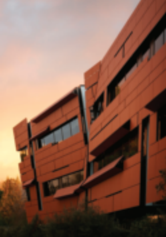
Thom Mayne Cahill Center, Caltech, Pasadena

After Hurricane Katrina, some of the finest architects in the world took up the challenge to help rebuild New Orleans. Their home designs aimed to ensure safety in the face of a similar storm, spurring architectural innovations that had the potential to save many lives.